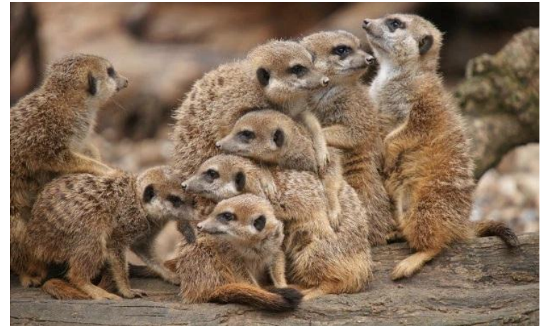
Human perspective. Swiss photographer Markus Walti finds the group above adorable and shy.